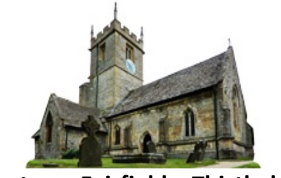
Hampton – Fairfield – Thistledown Eastwick Park – Charity Crescent